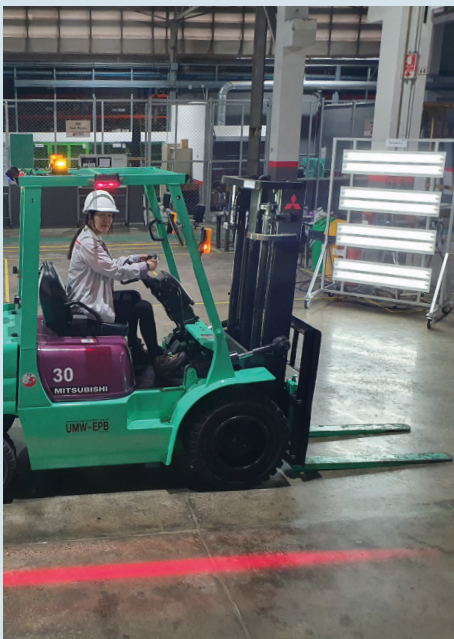
Speed Limit Alarm : Helps to reduce accidents caused by over speeding during operation.

Moreover, light-up alarms can warn workers to ensure confidence of safety while at work.