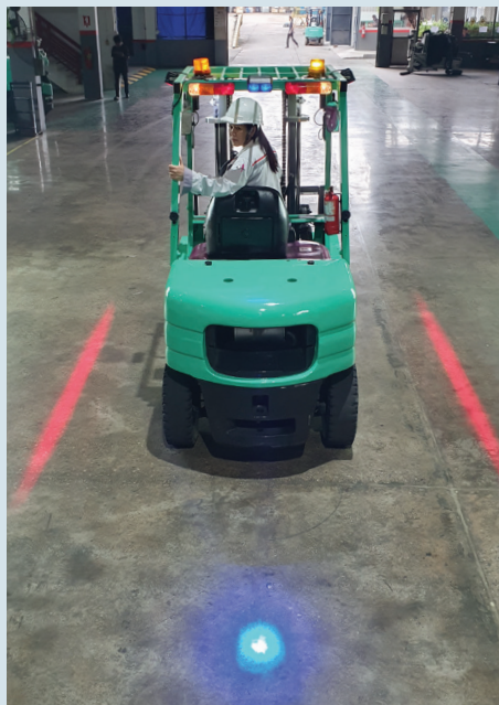
Blue Light : Helps to improve pedestrians' safety while forklift is approaching from blind corners or trailers.