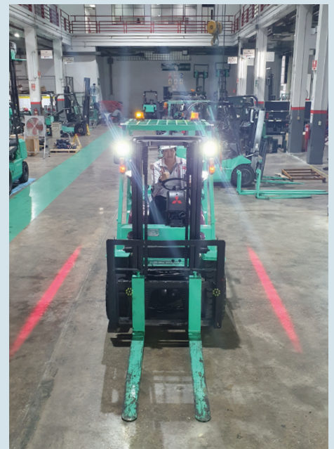
Zone Light : Helps to improve pedestrians' safety by clearly indicating a minimum safe distance from forklift.